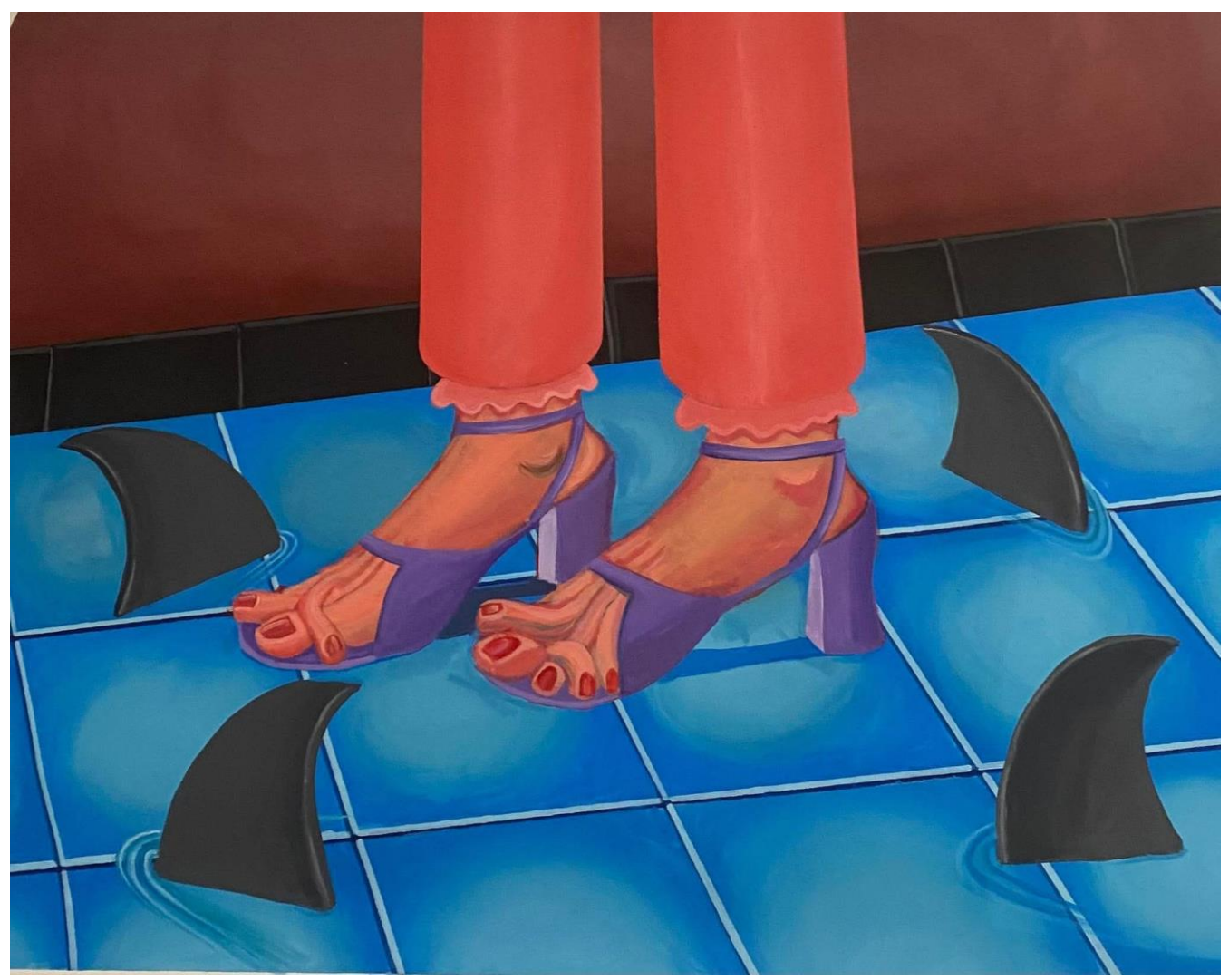
, They All Want To Steal My Guy, 2022, 75 x 95 cm